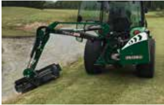
SPEARHEAD S32 COMPACT HEDGE CUTTER Ref. AG27386