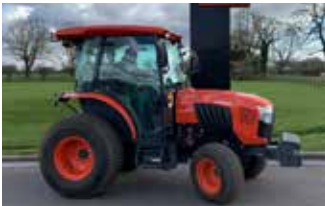
KUBOTA L2-622 COMPACT TRACTOR Ref. GC29248