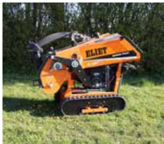
ELIET SUPER PROF CROSS COUNTRY MAX TRACKED SHREDDER Ref. GC13906