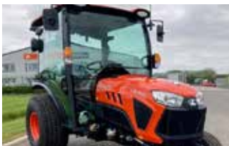
KUBOTA LX-401 COMPACT TRACTOR Ref. GC29250