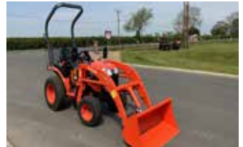
KUBOTA B1181 COMPACT TRACTOR & LOADER Ref GC18890