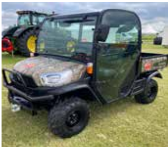
KUBOTA RTV X1110 UTILITY VEHICLE Ref. AG28765