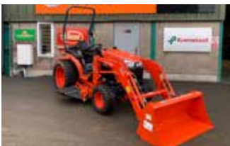
KUBOTA LX-351 COMPACT TRACTOR Ref. GC29249