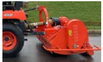
TOMLIN TFM FLAIL MOWER Ref. GC14393 1.25m width. In good condition.