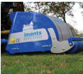
IMANTS ROOT PRUNER Ref. GC20777 Prunes roots up to 100mm in diameter with no clean up.