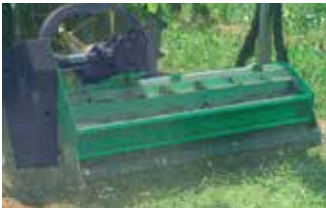
SPEARHEAD SNIPER 190 MOWER Ref. GC13805