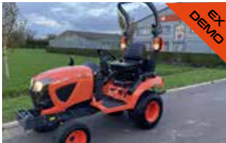
KUBOTA BX261 26HP SUB COMPACT TRACTOR Ref. GC28108