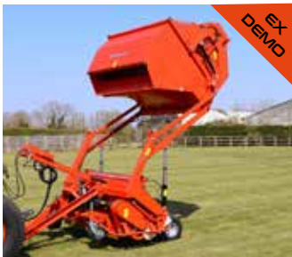
WIEDENMANN SUPER 500 FLAIL COLLECTOR Ref. GC13918