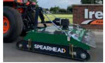
SPEARHEAD ROLLICUT 170 Ref. GC13814