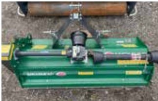
SPEARHEAD SNIPER 150 MOWER Ref. GC13819