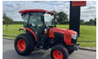
KUBOTA L2-452 COMPACT TRACTOR Ref. GC29231