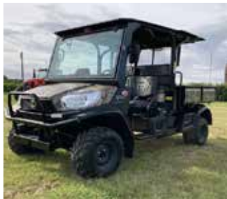
KUBOTA RTV X1140 UTILITY VEHICLE Ref. AG18278