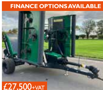
SPEARHEAD ROLLICUT 500 MOWER Ref. GC13813