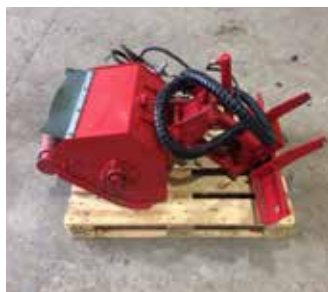
20 INCH HYDRAULIC DRIVEN FLAIL Ref. GC1731