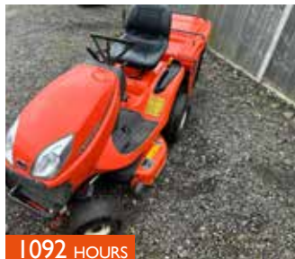
2006 KUBOTA GRI600-II RIDE ON MOWER Ref. GC29279