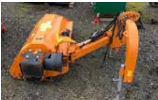
2016 BERTI TA/PS 200CM (TEAGLE) MOWER Ref. AG25714