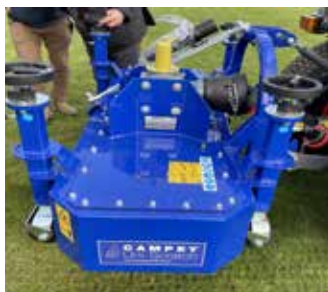
CAMPEY UNI-SCRATCH Ref. GC19637 For maintenance of natural and synthetic grass surfaces.