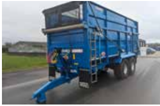
2022 STEWART GX 18 23 S C/W - Sprung drawbar, commercial axles with 560/60 R22.5 wheels, air & oil brakes with ABS, hydraulic rear door with grain chute, rollover easy sheet, silage kit and Transcover front to back hydraulic cover. Also available in GX 16 21 L Version.