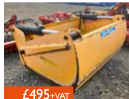
SHELBOURNE REYNOLDS SILAGE GRAB Ref. AG30410

C/W - Full cab with aircon and radio, HST transmission, AG tyres and fitted with LA805 EC loader with bucket. 30 hours. Warranty to 10/2025.