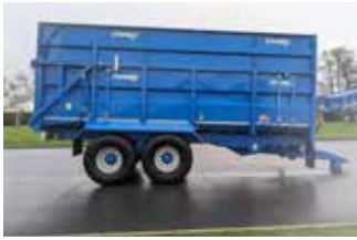
2022 STEWART GX 18 23 S C/W - Sprung drawbar, commercial axles with 560/60 R22.5 wheels, air & oil brakes with ABS, hydraulic rear door with grain chute, rollover easy sheet and silage kit. Also available in GX 16 21 L Version.