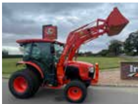
2023 KUBOTA L2452 COMPACT TRACTOR & LOADER Ref. GC30270

C/W - Full cab with aircon and radio, HST transmission, AG tyres and fitted with LA805 EC loader with bucket. 30 hours. Warranty to 10/2025.