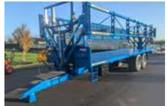
2023 STEWART GX 15 BH (32' long, 15t carrying capacity) C/W - Sprung drawbar, commercial axles with 560/60 R22.5 wheels, air & oil brakes with ABS. Hydraulic bale clamp sides. Suitable for 2-high bales or cabbage bins.