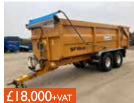
2021 RICHARD WESTERN SF18HS TRAILER Ref. AG30040

C/W - Sprung drawbar, air & oil brakes, arched full front window, hydraulic door & grain chute. Single tipping ram, 560/60 R22.5 tyres, commercial axles, silage kit, transcovers, highline lights.