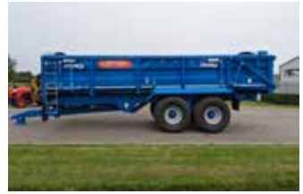
2023 STEWART GX 16 20 R (16t Root Spec. 3'9" Sides) C/W - Sprung drawbar, commercial axles with 560/60 R22.5 wheels, air & oil brakes, hydraulic rear door with grain chute, and rollover easy sheet.