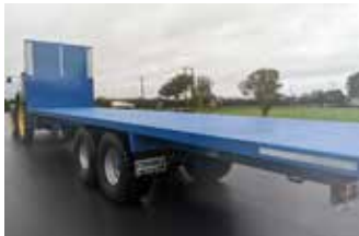
2023 STEWART GX 18 FT (36' long, 18t carrying capacity) C/W - Sprung drawbar, commercial axles with 560/60 R22.5 wheels, air & oil brakes with ABS. Hydraulic lift & lowered headboard.