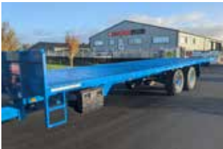
2023 STEWART GX 15 FT (32' long, 15t carrying capacity) C/W - Sprung drawbar, commercial axles with 385/65 R22.5 wheels, air & oil brakes with ABS. Hydraulic lift & lowered headboard.