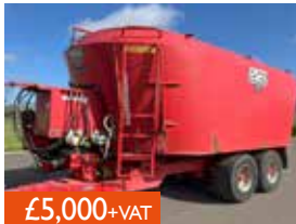
2015 HI SPECT 20 DIET FEEDER Ref. AG24061

C/W - 20m 3 capacity, twin auger, front right and rear right door, twin axles, 435/55 R19.5 tyres, front digital weigh screen & road lights.